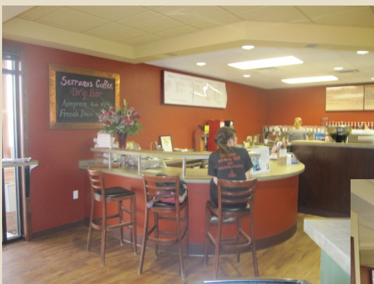
Coffee Drip Bar Features French Press and Aeropress Coffee Using the Coffee of your choice!