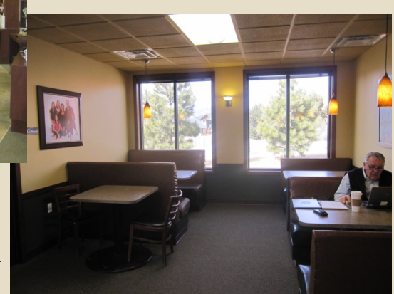
Optional Booth Seating