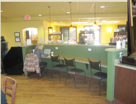
Lap Top Bar